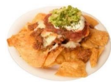
Popular No.1 Snack Nachos