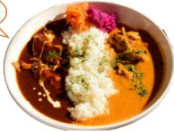
Beef stew and chicken Curry!

To you who can not choose either! Using two roux.