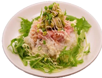
Fresh Tuna And Avocado Rici Bowl

The scent of spice becomes habit! Japanese chicken use.