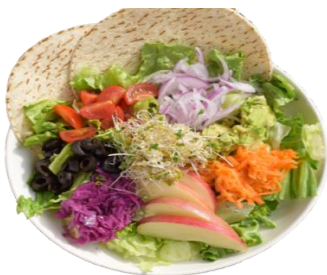
Vegan power salad

Repeat rate NO.1!!! This taco rice selling in Harajuku which makes spicy fragrance become habit with spicy spirits.