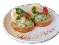
Shrimp and avocado canapes